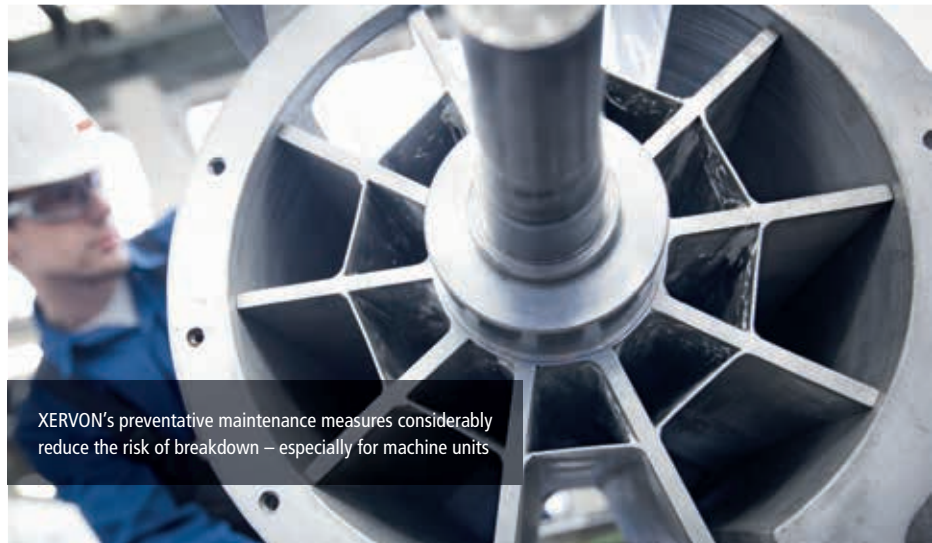
XERVON's preventative maintenance measures considerably reduce the risk of breakdown – especially for machine units

One of our specialties in this particular field is condition monitoring. We continuously monitor the life cycle of your machines so that you are not caught out by an individual machine part or a whole unit breaking down. By carrying out various types of offline and online measurement procedures – for example vibration and oil analyses, monitoring machines using remote system diagnostics or thermal radiation – our engineers are able to reach reliable conclusions