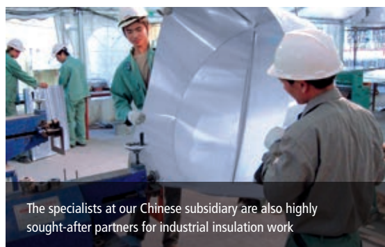
The specialists at our Chinese subsidiary are also highly sought-after partners for industrial insulation work

XERVON creates bespoke solutions. High quality results are always guaranteed thanks to our modern equipment and our employees' years of experience in different projects