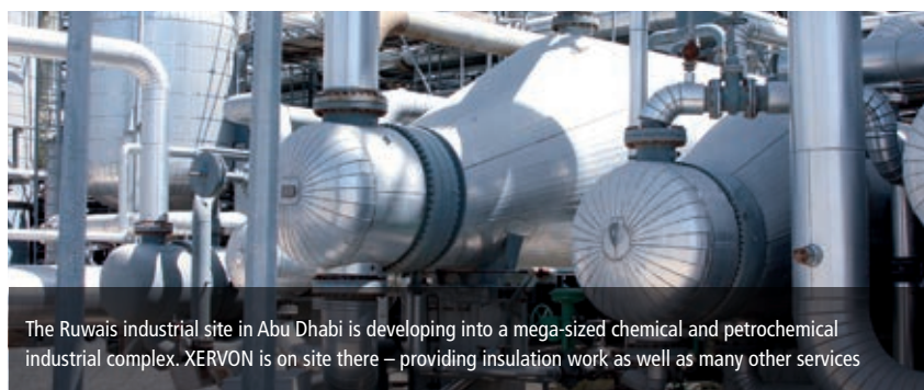
The Ruwais industrial site in Abu Dhabi is developing into a mega-sized chemical and petrochemical industrial complex. XERVON is on site there – providing insulation work as well as many other services