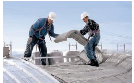
Wherever you need us: thanks to the know-how of our experienced specialists, no place is too difficult to access